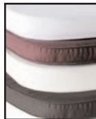
Chiavari Chair Cushions