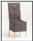
Chiavari Chair Cover